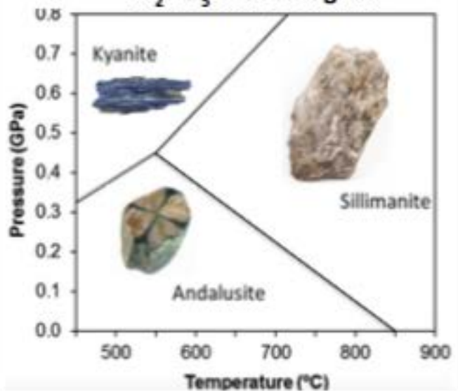
\text{Al}_2\text{SiO}_5 Phase Diagram

What are polymorphs? What do they tell us about formation conditions?